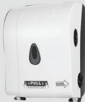
Model No.: OR/TD/06

MATERIAL STAINLESS STEEL # 304 GRADE CAPACITY : 400-450 SHEETS DIMENSION : W280 X H360 X D100 MM