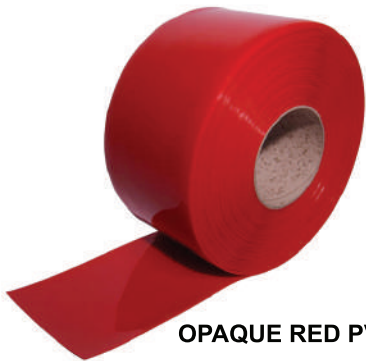
OPAQUE RED PVC