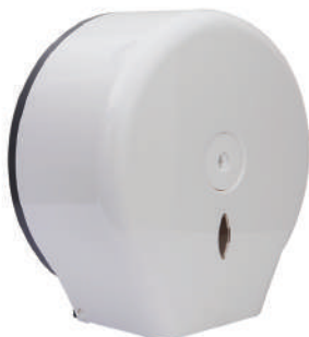
Model No.: OR/JRD/02

MATERIAL USED: SS BODY 304 GRADE DIMENSION: 265MM(L) X 100MM(W) X 255MM(H)