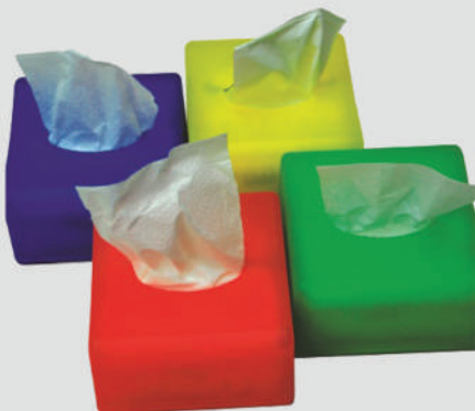
Model No.: OR/TD/07

WEIGHT : 3.1KG | MATERIAL : ABS | MODE : PULL DIMENSION: 300 X 237 X 410 MM