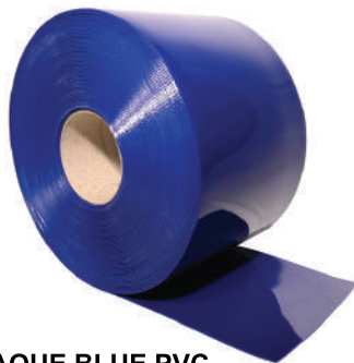
OPAQUE BLUE PVC