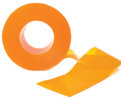
ANTI INSECT PVC