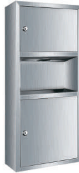
MULTI FUNCTION RECESS PANEL (EXPOSED) 2 IN 1 - 304 GRADE. (PAPER DISPENSER / WASTE RECEPTACLE) DIMENSIONS : 750 (H) X 300 (W) X 140MM (D)