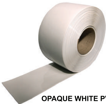
OPAQUE WHITE PVC