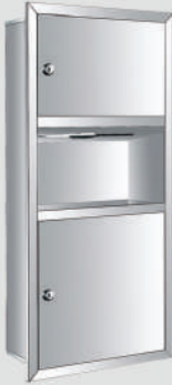
MULTI FUNCTION RECESS PANEL (CONCEALED) (2 IN 1 - 304 GRADE. (PAPER DISPENSER / WASTE RECEPTACLE) DIMENSIONS : 750 (H) X 345 (W) X 145MM (D)