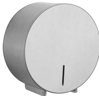
Model No.: OR/JRD/01