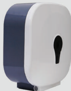
Model No.: OR/JRD/04

MATERIAL USED:ABS DIMENSION: 283MM(L) X 110MM(W) X 298MM(H) COLOUR : WHITE